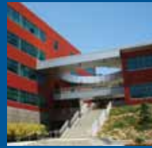
MSA / MSB