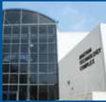
ATA / ATB