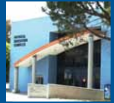
PEC / N / S